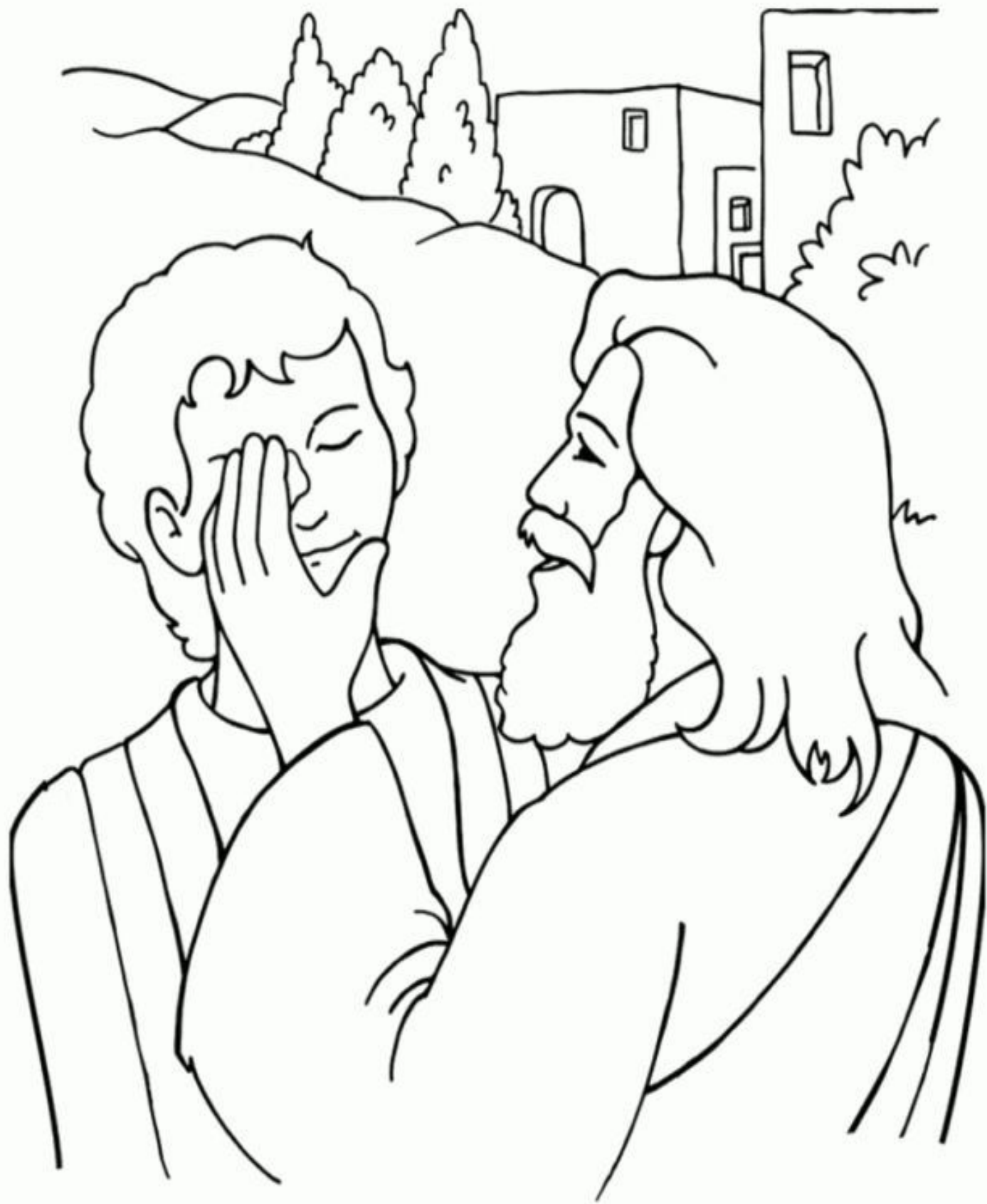
Jesus Heals a Man Born Blind John 9